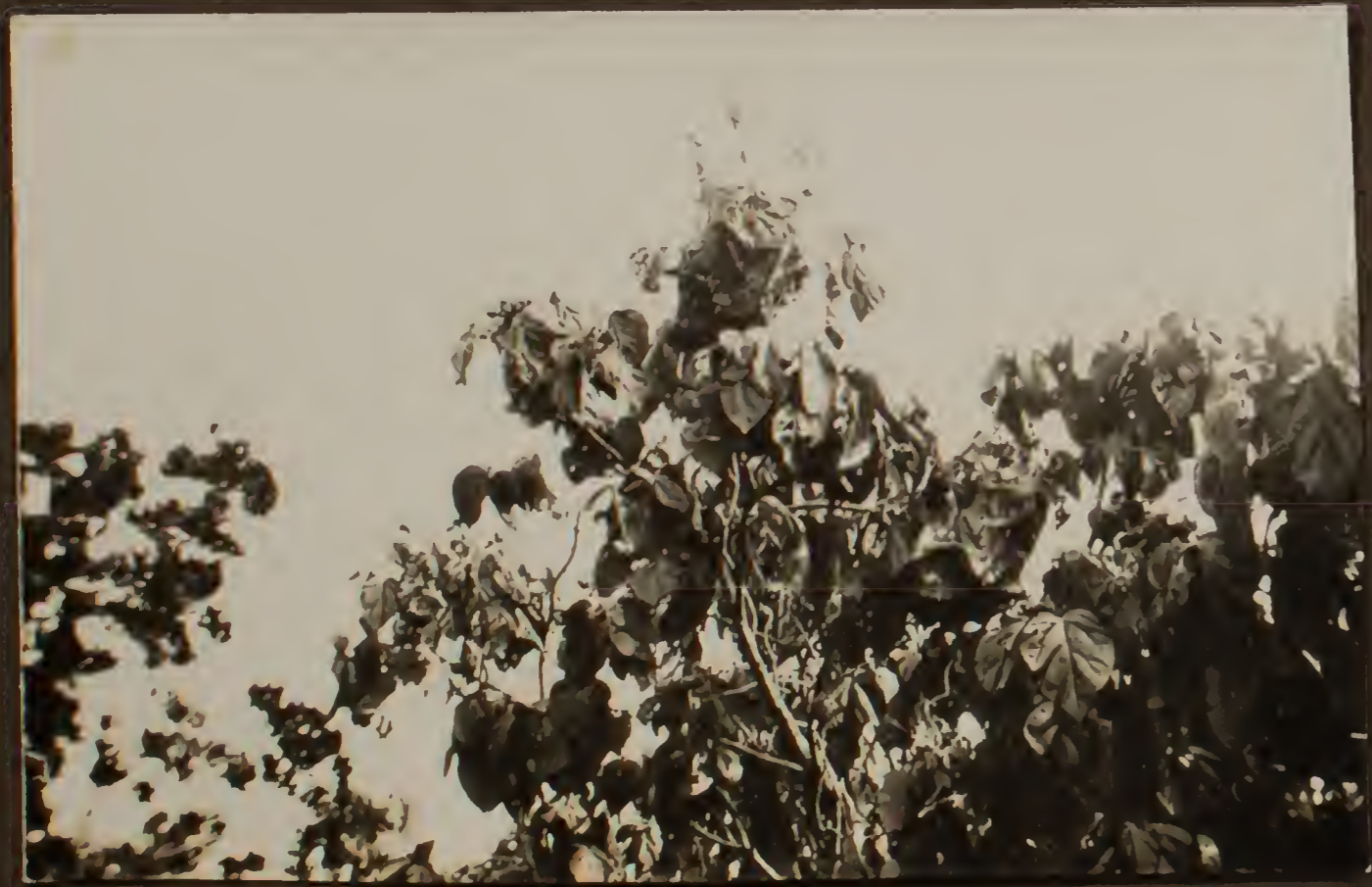
Green shrub (Madagascar) dry land